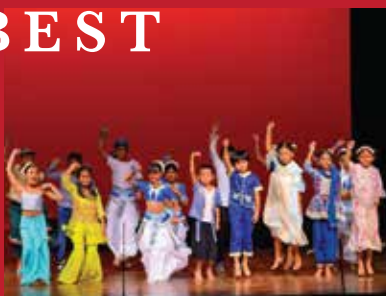
A collection of the year's best Assemblies, in which every child in the Junior School takes part.