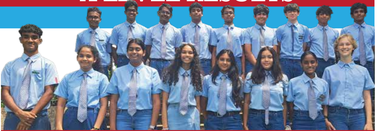
19 STUDENTS ACHIEVED SEVEN OR MORE 9s

Another year of outstanding results saw nine students achieve four A*s at A Level and eleven achieve eight or more 9s at IGCSE. Overall, 35% of all A Level grades were A*s and 66% A* or A. At IGCSE, 50% of papers were graded 9 and 75% 8 or 9, equivalent to the old A*. The results were the school's best ever at both IGCSE and A Level, excluding those based on lower grade boundaries during and after Covid.